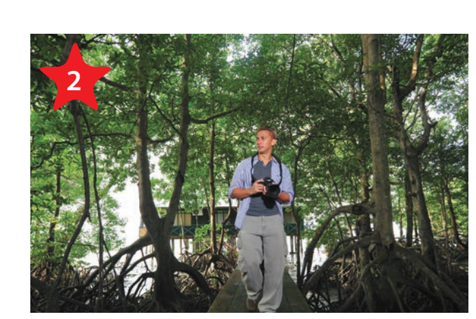
KUALA GULA BIRD SANCTUARY

+605 689 8800 (Manjung Municipal Council)