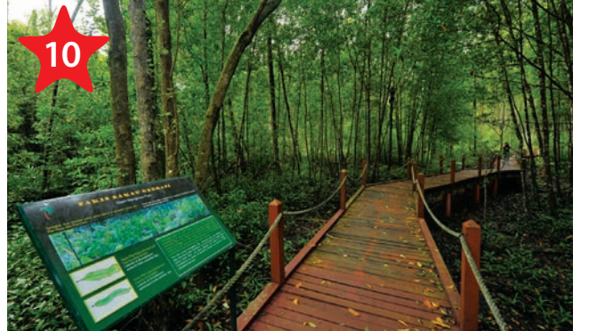
Matang Mangrove Forest Reserve has a rich biodiversity. It is teeming with species of trees, birds, fish and other aquatic life

important historical events in the form of a diorama. ( +605 631 1462