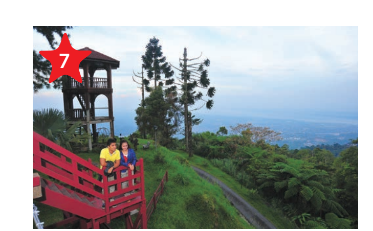
BUKIT LARUT (MAXWELL HILL)

Bukit Larut, once known as Maxwell Hill, is Malaysia's smallest hill resort. Perched 1,250m above sea level, it towers over the scenic town of Taiping. Its virtually undisturbed montane forest was gazetted as a permanent forest reserve in 1910 and houses a bountiful collection of flora and fauna. ( +605 807 7241