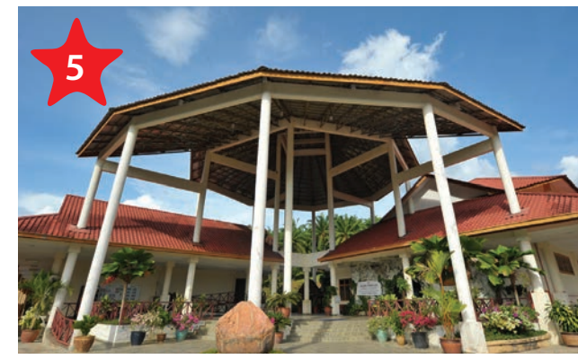
LENGGONG ARCHAEOLOGICAL GALLERY Named a UNESCO World Heritage Site in 2012, Lenggong Valley is one of the world's most important archaeological sites. One of its many prehistoric caves was the burial site of the Perak Man. The first-of-its-kind in the country, the Lenggong Archaeological Gallery houses an impressive collection of prehistoric artefacts.

Nestled within the protected Belum Valley, Royal Belum's unspoilt wilderness possesses a complex ecosystem and is one of the few places in Malaysia where one can find the rare Rafflesia. It is also an important habitat for a number of endangered species such as the seladang, the Asian Elephant, the Malayan Tiger and the Sumatran Rhinoceros. +605 791 7858 / 4543