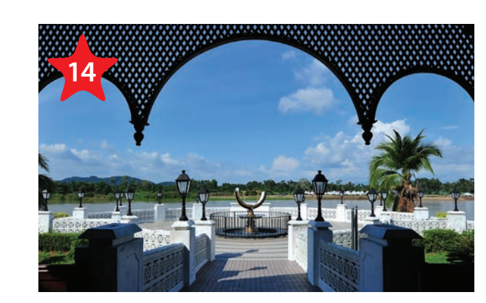
PASIR SALAK HISTORICAL COMPLEX Pasir Salak Historical Complex is a tribute to the Malay warriors of vestervear who had rebelled against the British rule and inspired nationalism. Here, these warriors are

( +605 776 1141 (Office of DYMM Paduka Sri Sultan Perak)