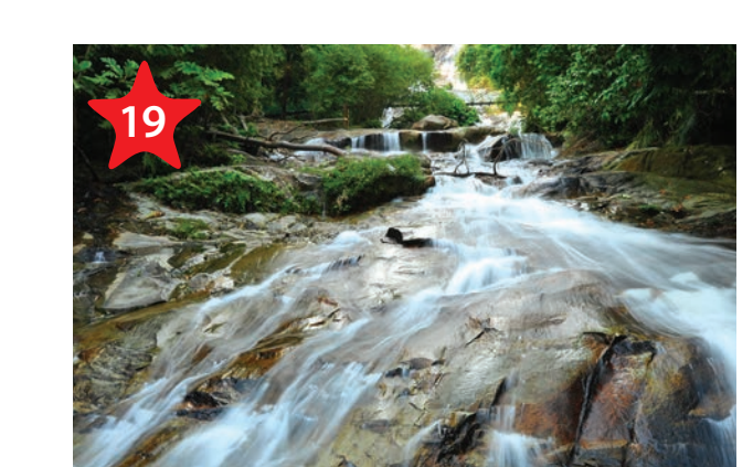
TAMAN EKO RIMBA LATA KINJANG

This eco park is situated around 15km from Tapah. It has a magnificent multi-tiered waterfall that is visible from the North-South Expressway. A popular picnic spot, the waters of Lata Kinjang cascading down the mountain make for a truly spectacular sight.