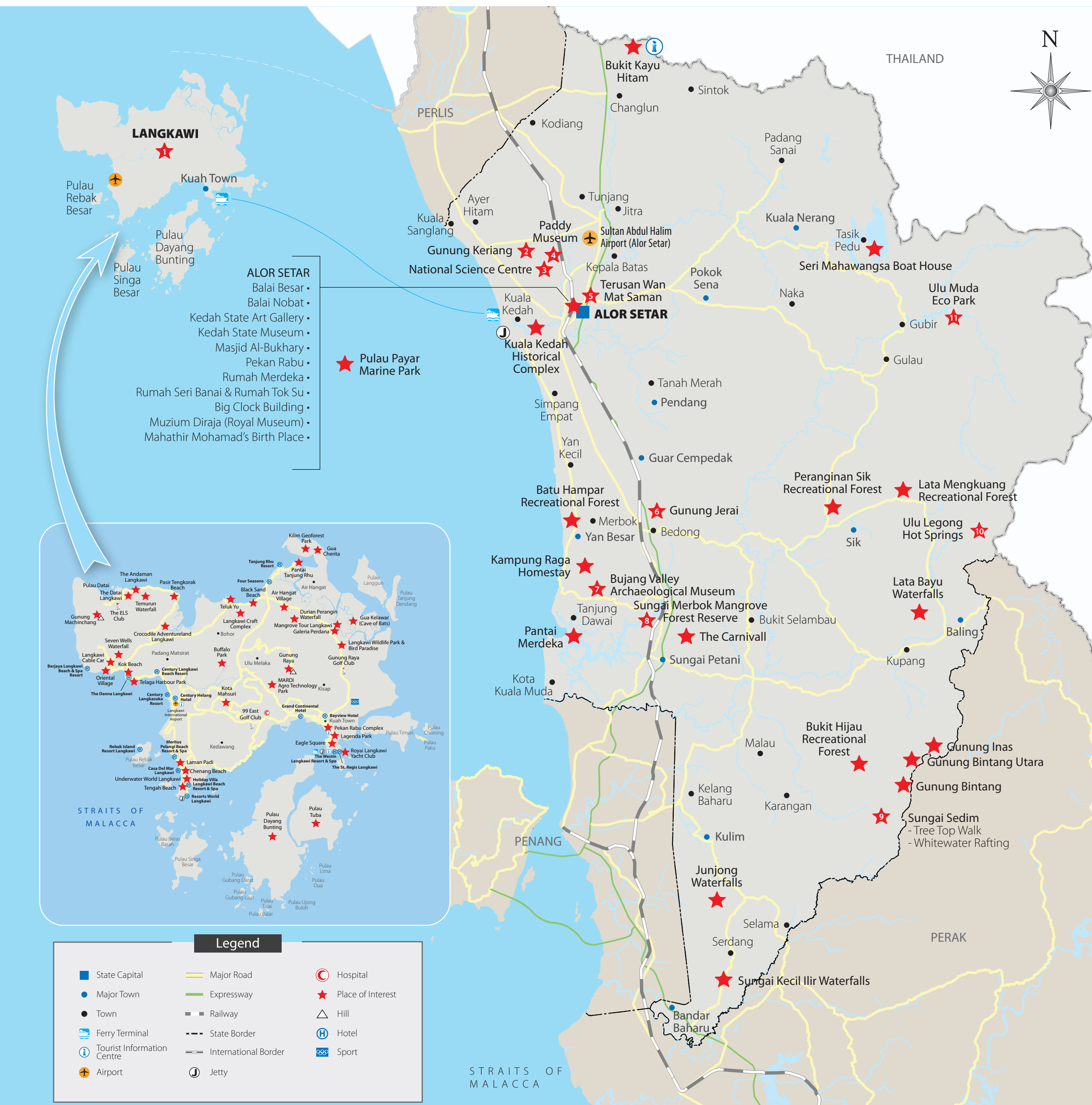
*Map not drawn to scale

ULU MUDA ECO PARK Tucked away in the northeastern corner of Kedah, this remote 120,000-hectare forest is known as a sanctuary for endangered and rare wildlife. The area is home to 109 species of mammals, 54 species of reptiles, 33 species of fish and 200 species of bird. Activities include camping, birdwatching, fishing and jungle trekking. The entry point to the park is from Gubir Jetty. Accommodation is available in Gubir and at the nearby Pedu Lake. www.ulumuda.com